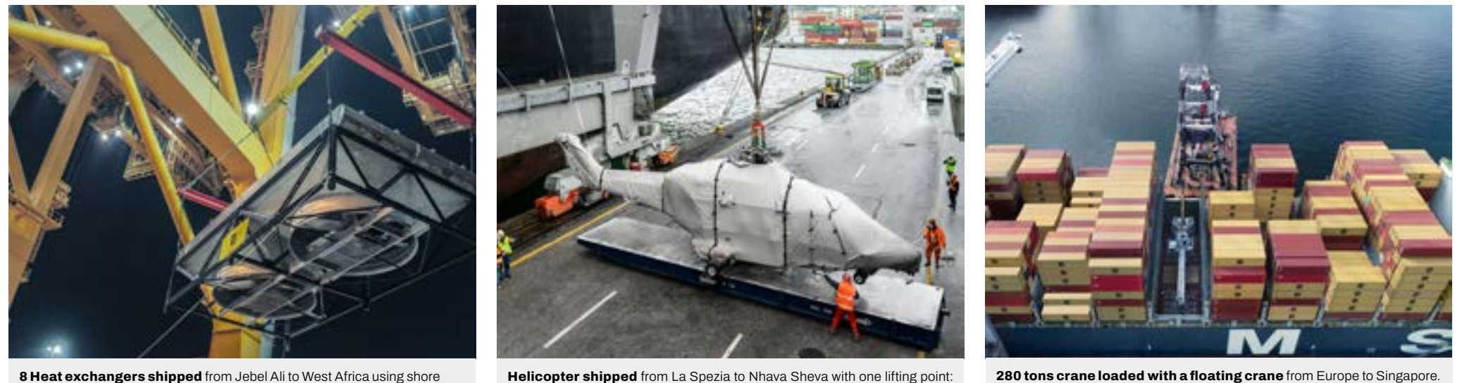
Helicopter shipped from La Spezia to Nhava Sheva with one lifting point: the rotor.

We are committed to finding the best transport solution for your special cargo, whatever its dimensions, weight and destination.