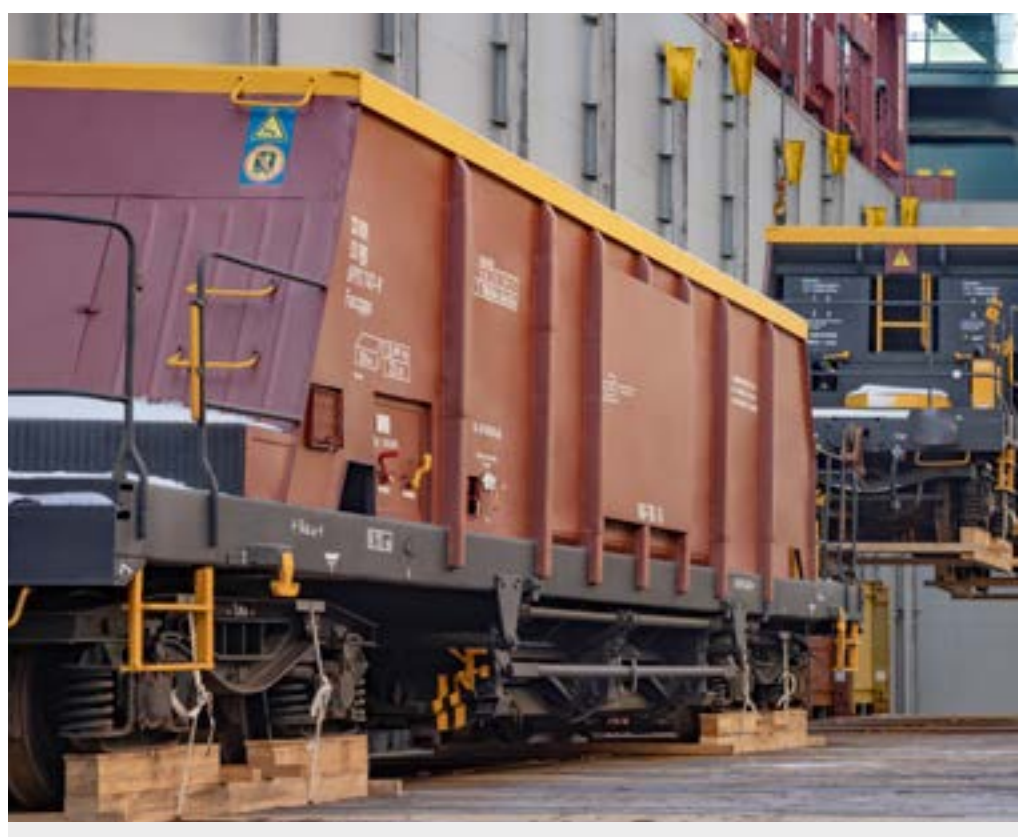
11 rail hopper wagons shipped in the same voyage from Antwerp to Montevideo.

As part of our feasibility studies and preparation, 3D modelling is used to demonstrate handling stowage and lashing requirements