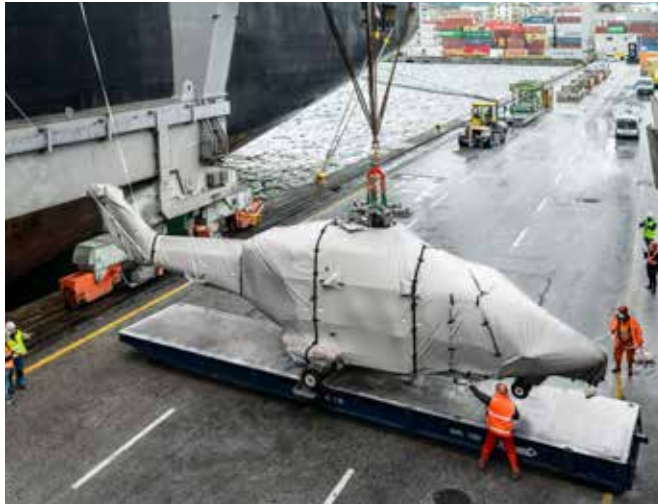
Helicopter shipped from La Spezia to Nhava Sheva with one lifting point: the rotor.