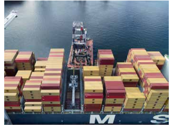
280 tons crane loaded with a floating crane from Europe to Singapore. Dimensions of 33 meters in length, 6.74 meters in width and 12.17 in height.