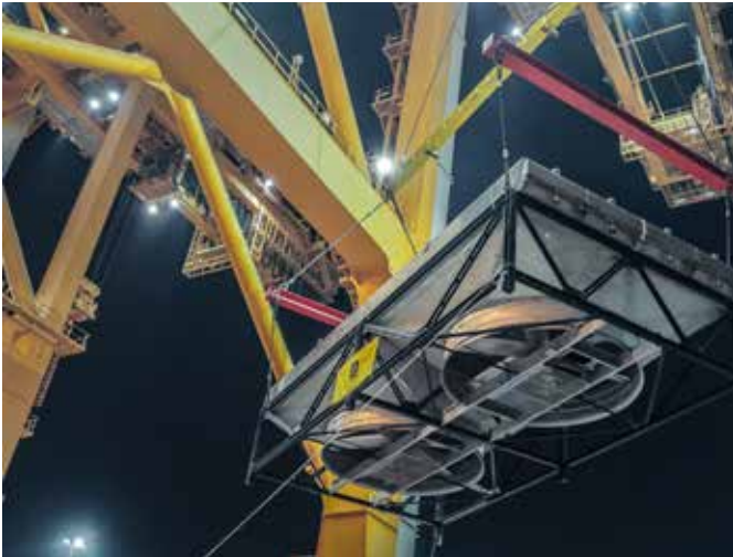
8 Heat exchangers shipped from Jebel Ali to West Africa using shore Gantry crane.

We are committed to finding the best transport solution for your special cargo, whatever its dimensions, weight and destination.