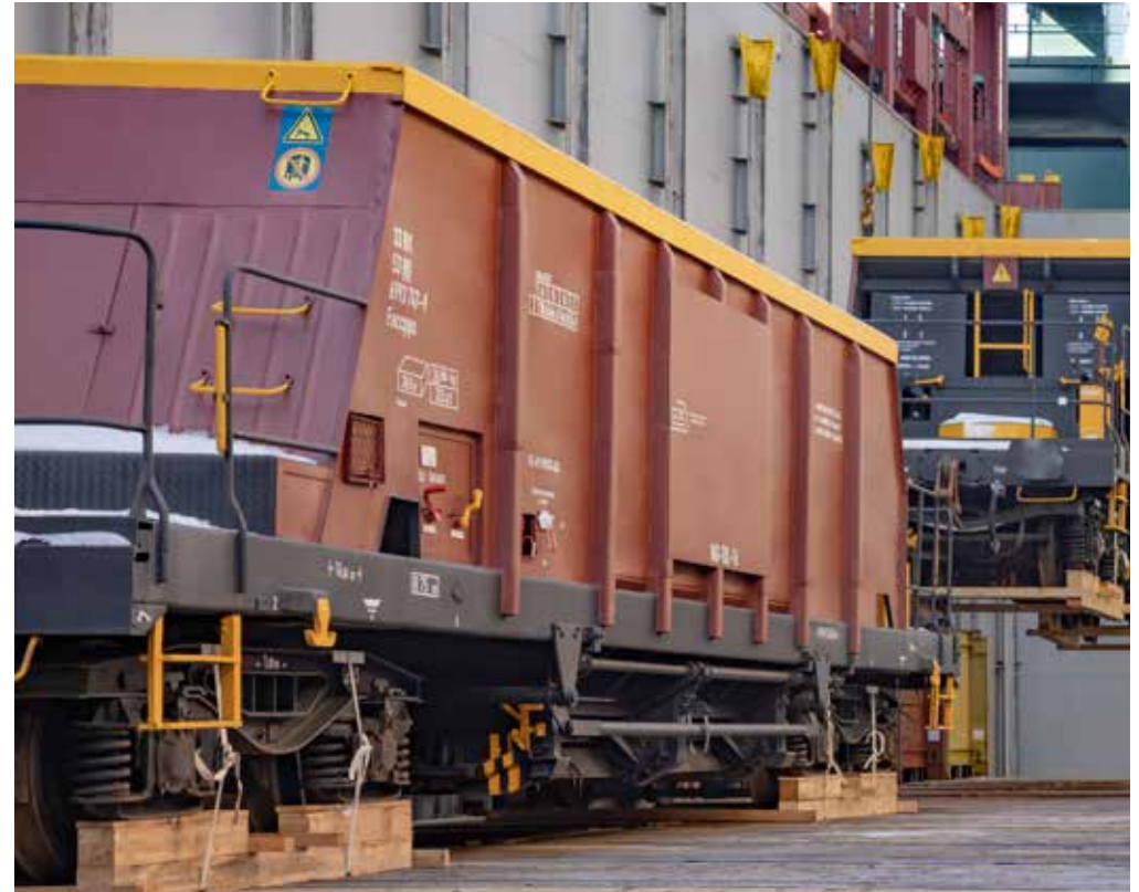
11 rail hopper wagons shipped in the same voyage from Antwerp to Montevideo.

As part of our feasibility studies and preparation, 3D modelling is used to demonstrate handling stowage and lashing requirements