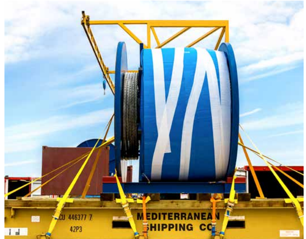
Out-of-gauge cargo loaded in Felixstowe

Our experts assure you of a tailor-made solution for a safe and secure delivery